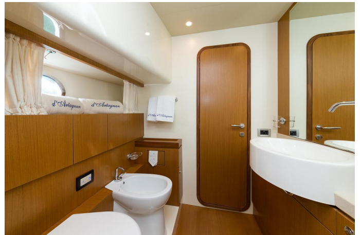
The lower accommodation with the exclusive full-beam master suite with two large panoramic windows, the vip cabin and the twin cabin, all equipped with soft furnishing and bathroom, provide top quality of life on board.