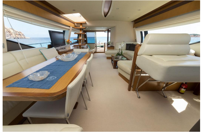
The saloon is light and airy with beautiful dining area and his soft colour of the furniture.